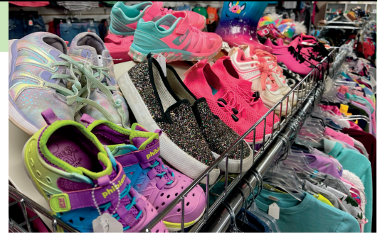
Some of the great inventory at ABLE KID THRIFT

This May, ABLE KID THRIFT has expanded their inventory to include sizes for all children from newborn to size 18 in clothing and shoes up to size 5. They also still carry other gear for your little ones such as larger toys and strollers. Amy Belile pictured above says that the change is good because more people can shop the store and find what they are looking for. She was right. The Saturday that I went to shop, I found so many great items for my kids including name brands like UnderArmour, Adidas and more. My little girl was pleased to stomp out of the store with her new light up unicorn rain boots, jumping in every puddle on the way to the car. Amy also shared, "We get a lot of clothes, people are so nice to donate to help us. It's good work for everybody here." ABLE is grateful for the community's support as we continue to provide work opportunities for people with disabilities in a variety of ways. by: Janelle Stoneking